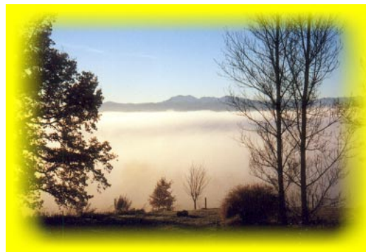
Dawn at Providence

We have ideal conditions for groups of up to 12 people